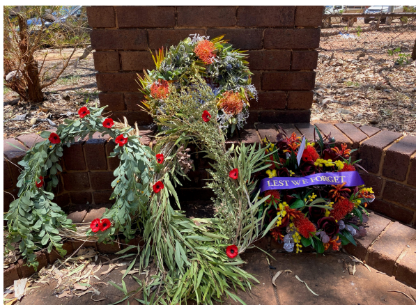
Wreaths laid at the Lions Park War Memorial in Derby to commemorate Remembrance Day 2020.

About 50 people attended the Remembrance Day service in Derby on 11 November 2020 at the Lions Park War Memorial in Loch Street, with the ceremony commencing at 10.45am.