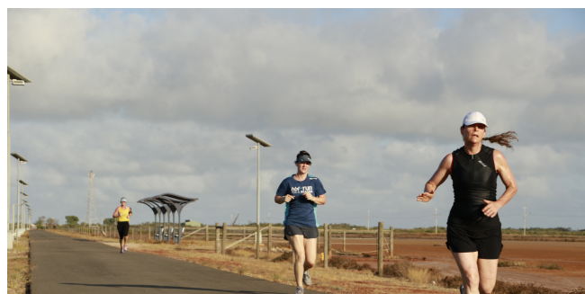
Dash and Splash competitors earning their refreshing swim after an early morning run in sweltering conditions.