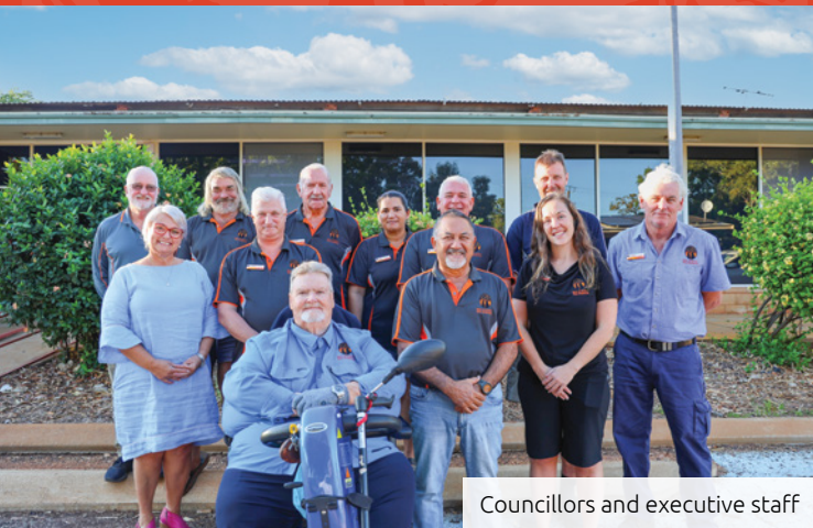
Councillors and executive staff