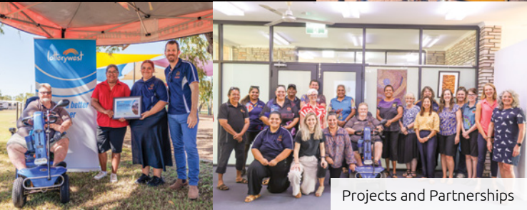
Projects and Partnerships